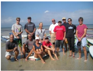
CCWA volunteers and Worldwinds staff after another successful DWD at Bird Island Basin