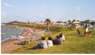
Spectators and gear line the shore at Oleander Point during the U. S. Open in ????