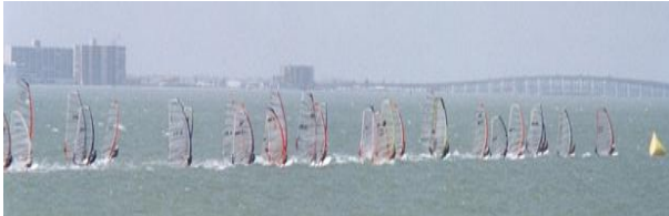
Racers at the start of one of the U. S. Open races in Corpus Christi Bay at Oleander Point